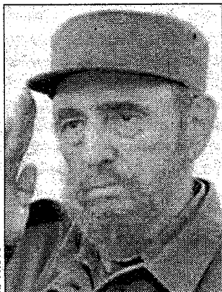
Cuban President Fidel Castro

Castro is riding higher today than he ever has since the Russian bear tripped and fell. With his deep-pocketed pal Hugo Chávez's investments in the democratic takeover of Latin America, Fidel's eternal dream is well