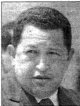
Venezuelan President Hugo Chávez

on the way to realization. With most Spanish-speaking countries ripe for being baited with Venezuelan oil and/or money, no amount of State Department fantasy world huffing and puffing will knock this power hungry consortium down. Worse yet, Condi Rice's backing of this inane proposal knocks her credibility down a peg or two.